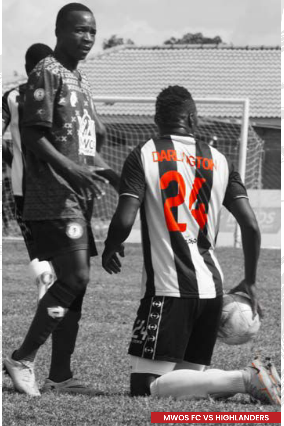
MWOS FC VS HIGHLANDERS

As the team continues to build on these performances, the support from the stands is sure to grow even stronger, driving MWOS FC forward in their quest for glory.